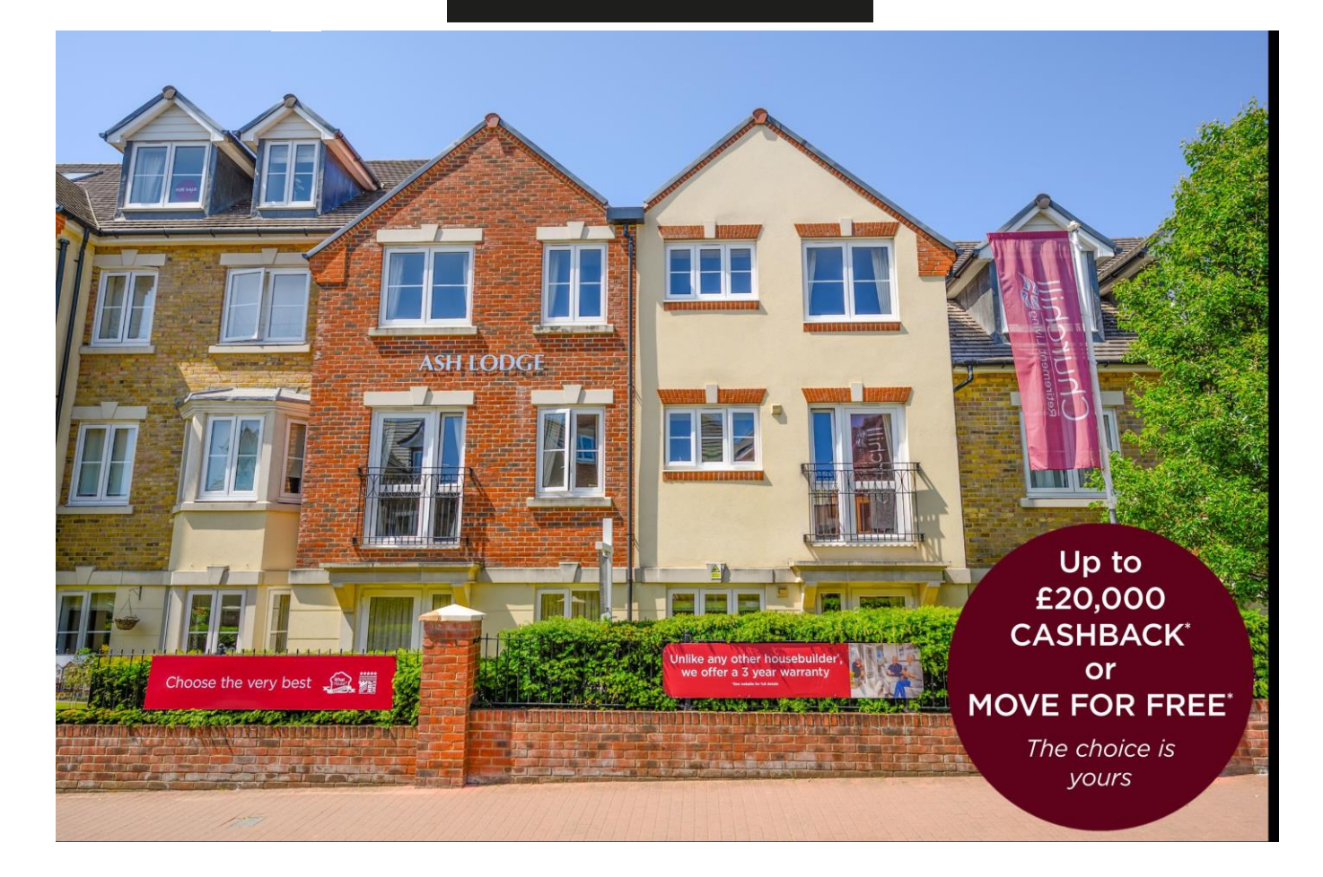
51 Ash Lodge Churchfield Road Walton on Thames Surrey KT12 2EZ